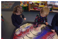
November 5 th firework fun

Christmas activities start on Monday 2 nd December